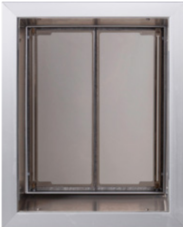
Exterior View (outside of home)

Each wall unit includes an aluminum tunnel that connects the interior and exterior frame. The tunnel materials ensure a professional fit and finish that provides a quality appearance for your home.