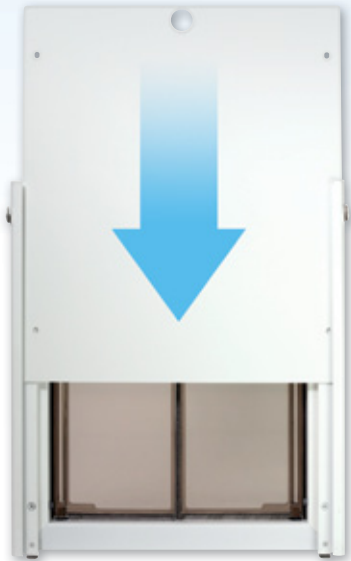
Security plate slides into place