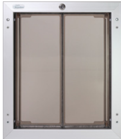
Interior View (inside of home)

The PlexiDor WALL Unit won't rust, has no sharp edges and is easy to clean.